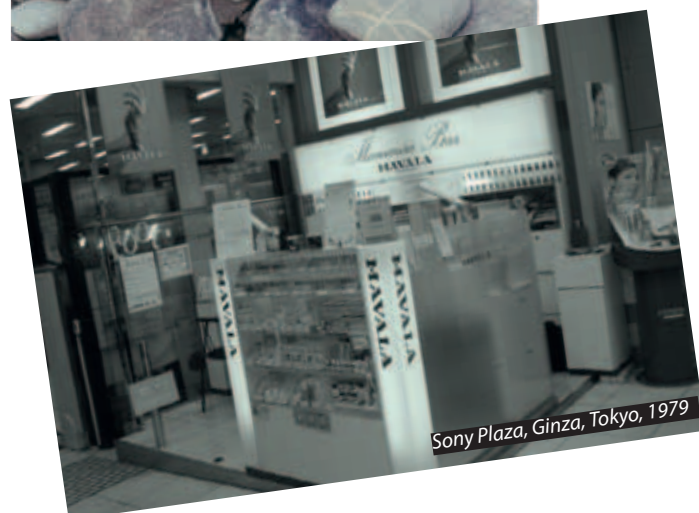
Sony Plaza, Ginza, Tokyo, 1979