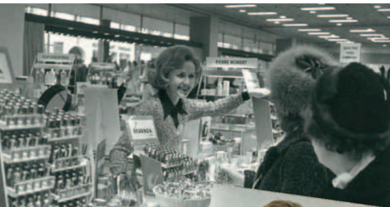
Le magasin du Nord, Copenhagen, 1962