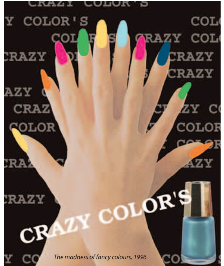
The madness of fancy colours, 1996